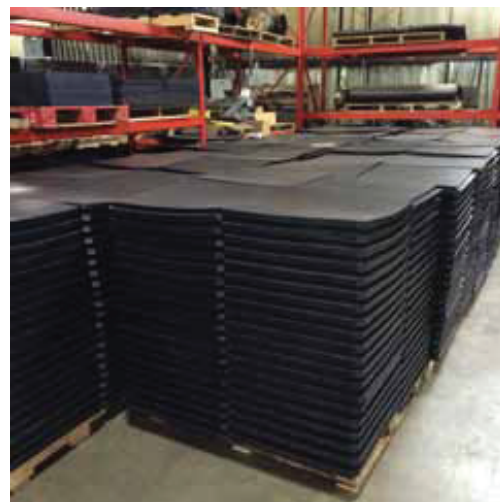
Cumberland Rubber Supply Nashville, TN

Our most popular product line is our vulcanized ballistic control products. Our panels, sheets, and blocks are designed to furnish a safe live fire environment by controlling bullets on contact, stopping/preventing ricochet, and self-healing after impact. Cumberland Rubber Supply products provide superior overall safety in live fire training environments. If ballistic control and safety is important, then we have the premium products you need.